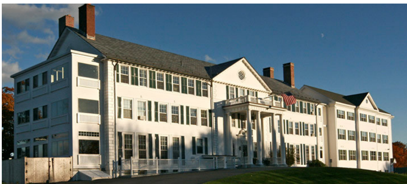
The Plant Home